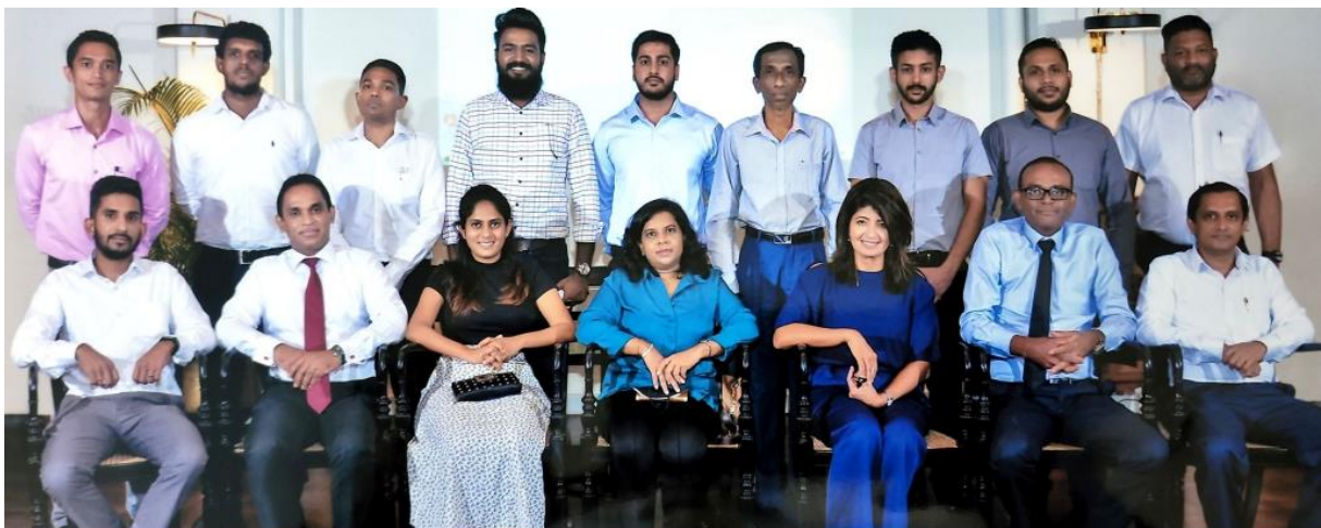
The Launch of the market access program held on 31st May 2022 at Hatch Works